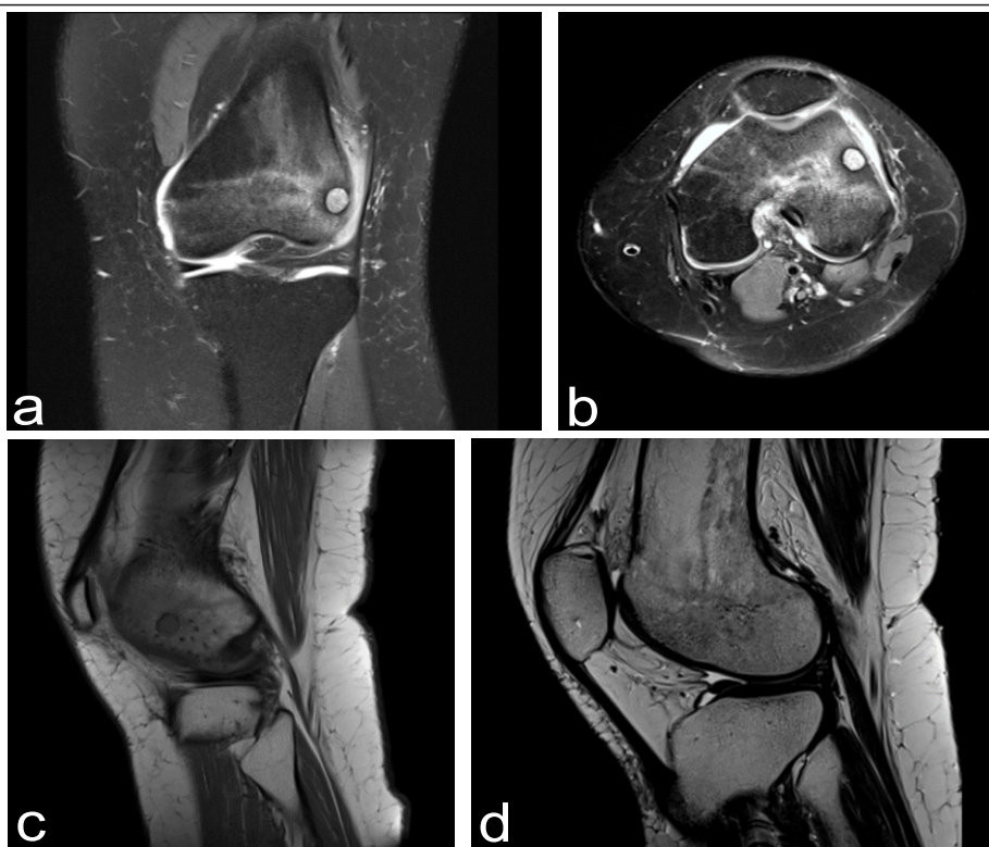
Figure 2: Magnetic resonance image of the left knee after the application of focused extracorporeal shockwave therapy (a) Coronal section (b) Axial section (c) Sagittal section T2 sequence (d) Sagittal section in T1 sequence.

The patient initially underwent focused ESWT treatment without having an accurate diagnosis. When using this therapy, as described by Wang et al. [8], a biological effect is produced in the tissues, stimulating the production of angiogenic factors, which induce neovascularization. Specifically in bone, angiogenic activity includes increased production of nitric oxide synthase, vessel endothelial growth factor, bone morphogenetic protein-2, and proliferating cell nuclear antigen. In this way, the pain and symptoms were accentuated in the patient, since in the face of neovascularization caused by treatment with ESWT, the natural history of this DT was accelerated. Furthermore, the