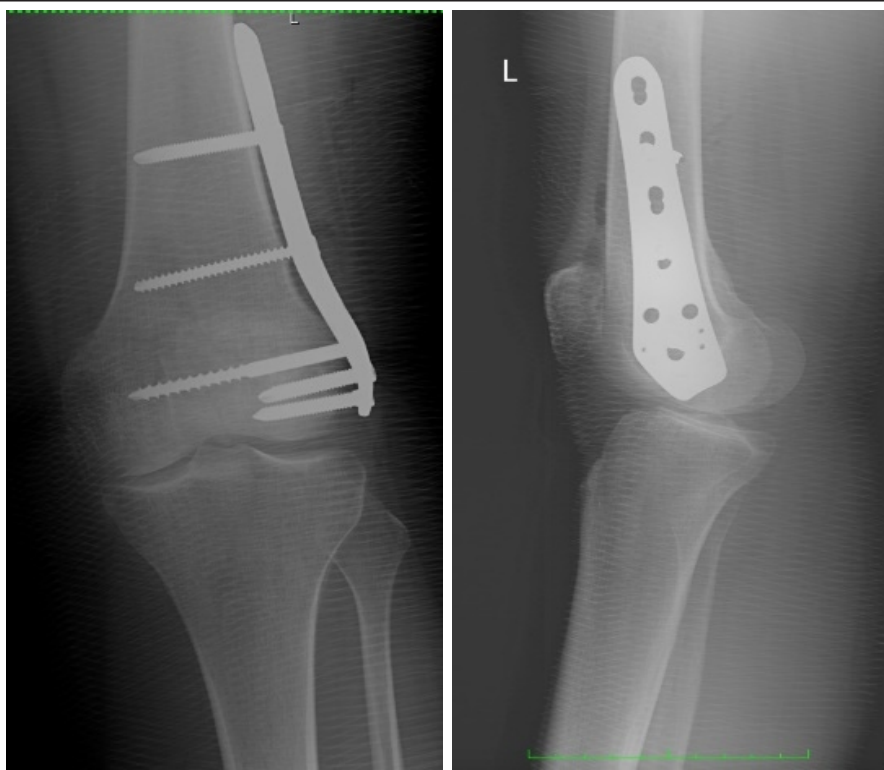
Figure 3: (a) AP and (b) lateral radiographs of the left distal femur after extensive curettage. The osteosynthesis plate is placed at the level of the lateral condyle.

production of anti-apoptotic factors such as the BCL-2 protein is increased as well as pro-apoptotic factors such as BAX and caspase 3