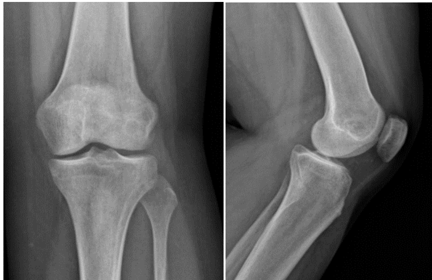
Figure 1: (a) AP and (b) lateral radiographs of the left knee with the presence of a radiolucent mass at the level of the lateral femoral condyle on the left side of approximately 5 mm diameter.

in the patellar tendon or for ligamentous or meniscus injuries.